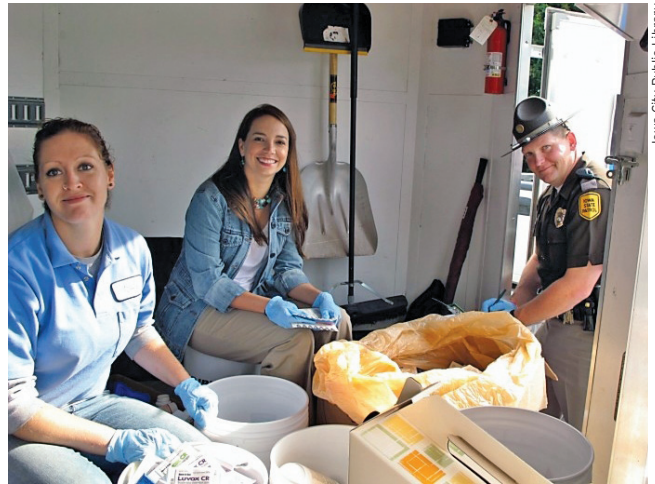
Iowa City Public Library staff members and community partners conduct their first of two expired pharmaceutical collection events. This very successful event netted over 135 pounds of expired or unused pharmaceuticals.

including the library director, police chief, city attorney and facilities manager. As a result he states that he has developed a new relationship with the library director, a better understanding about the library, and a greater appreciation for the multiple talents of the members of his team.